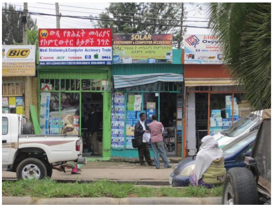
Photo 1 Electronic equipment retail shops in Kazanchis, Addis Ababa

over urban Ethiopia. In Addis Ababa, one major distribution cluster is located in the Kazanchis area, where more than 100 shops sell new and used electronic products such as printers, copy machines, computers and mobile phones.