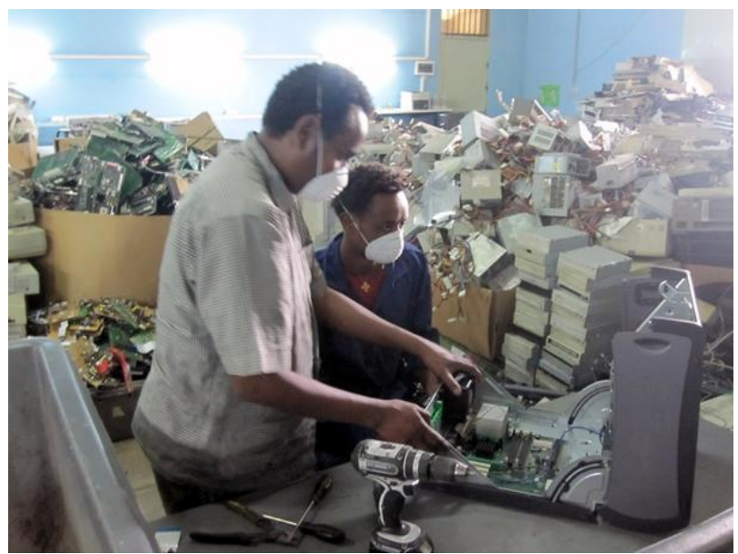
Photo 4 Computer dismantling in the Demanufacturing Facility in Akaki