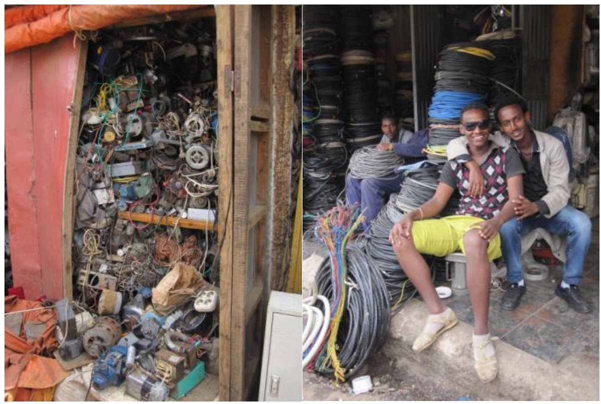
Photo 5 a & b Shops dealing with used EEE in Merkato Market, Addis Ababa