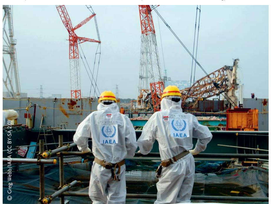
FIGURE 3: Two experts of the International Atomic Energy Agency examine recovery work on Fukushima Daiichi Nuclear Power Station on April 17, 2013 as part of a mission to review Japan's plans to decommission the facility. The Fukushima disaster in 2011 has been a key accelarator of the German energy transformation.

On the other hand, the agricultural, agribusiness and food sectors as well as most major political parties still widely support conventional production. The 20 percent target relating to organic agriculture has been maintained, but governmental support is weak. Unlike in the energy transformation, analyses exploring the environmental relief effect and scenario studies modelling pathways, costs and benefits of a transformation to 20 percent (or even 100 percent) organic agriculture are rare (an exemption is Wirz et al. 2017). Despite the fact that the initial "Agrarwende" for the first time contested the narratives legitimising conventional agriculture at government-level (Gerlach et al. 2005, Boschert 2005), its legitimisation through images of "Heidi"-style farming is still dominant in marketing. And while more and more farms surrender, the German Farmers' Association still exerts a cul-