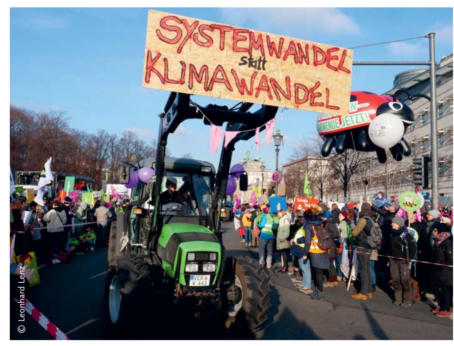
FIGURE 4: Since 2011, a coalition of NGOs organises the annual protest march Wir haben es satt! ( We are fed up! ) in Berlin, calling for a transformation of agriculture. In 2019, this farmer escorts the protesters with his tractor and demands "Systems change, not climate change".

consequently. Moreover, our analysis shows that one should be aware of unintended negative side effects of one sustainability transformation to another (in this case, the promotion of bioenergy).